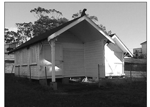
Exterior of the chalets

For some time members of our group have been very concerned about the long-term survival of the two chalets from the former Tasmanian Consumptive Sanatorium which now sit in the grounds of the St John's Precinct between Karingal and the former Parsonage. Late last year the Friends of the Orphan Schools Committee was given permission to organise some conservation work on the chalets.