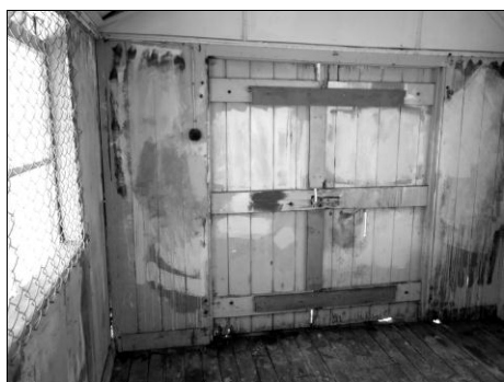
Interiors of the chalets

This will be a major project for us and the Committee is very keen to hear from members and others who would like to be involved. If you have something to contribute, whether it's building or project management skills or just a willingness to pitch in at a working bee, or would like more information, please make contact through any of the methods at the end of this newsletter.