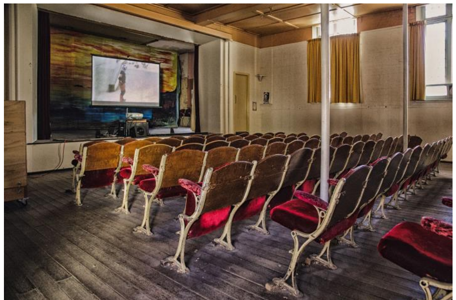
The theatre will be repaired

Many people expressed interest in being involved in an arts project entitled Healing Ground that Kickstart are producing over the next 12 months. Community members are invited to create artworks in which they share stories about the history, the present and future of the site for public presentation at the launch of the completed first round of building repairs later in 2019. Kickstart Arts have a long history in working with community members to help them make beautiful art from personal stories.